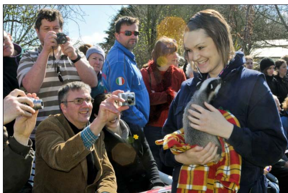
A chance to see these beautiful creatures up close