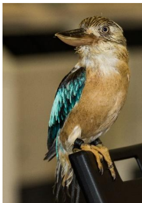
Blu – the Kookaburra