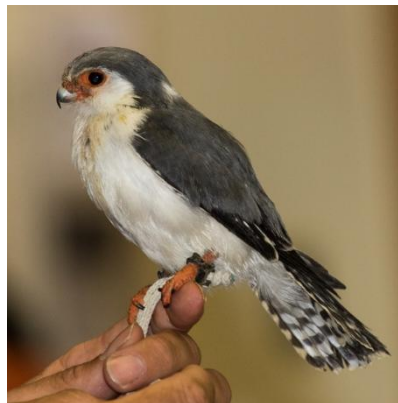
Rocco – the Pygmy Falcon